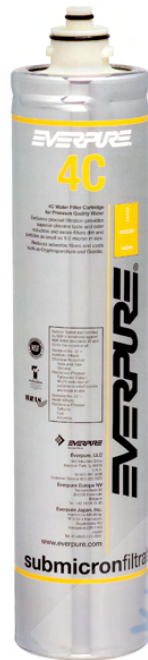
4C Replacement Cartridge: EV9600-00 (1-pack) EV9601-00 (6-pack)

Delivers premium quality water for cold cup vending applications